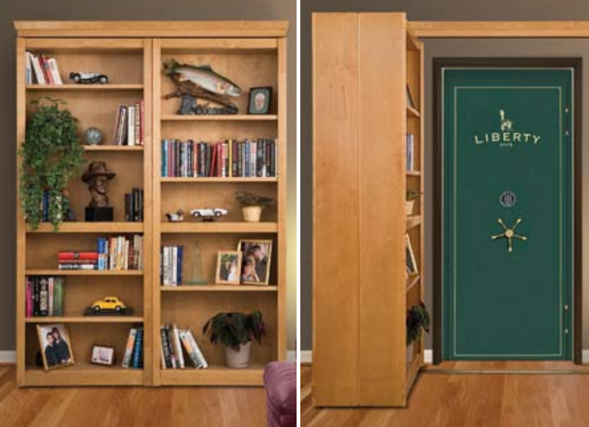
Custom widths from 36" to 66" and in heights up to 96"