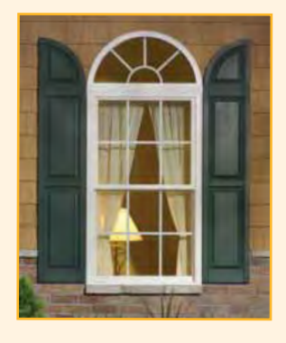
Raised Panel Shutter with Arched Tops

Raised panel shutters offer the unique, turn-of-thecentury look of the grand homes of the South, but with a contemporary richness and style. Their simple lines create a striking profile to your home that is reminiscent of our early American heritage.