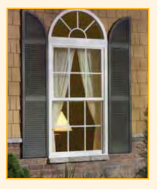
Louvered Shutter with Arched Tops

Nothing gives your home a classic look like louvered shutters. Steeped in the traditions of American history, our elegant louvered shutters provide the perfect finishing touch to your home by capturing the rich natural woodgrain texture of real wood shutters.